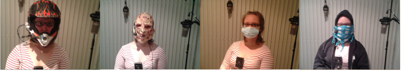
Figure 1: The speech material under face cover is collected with support from Finnish National Bureau of Investigation and University of Helsinki. A Finnish female volunteer wears 4 different face covers: motor cycle helmet, rubber mask, surgical mask and hood + scarf. The speech is recorded with 3 microphones. Both spontaneous and reading speech are considered.

manner. Apart from the acoustic absorption properties of the mask, by wearing a face mask, some of the speech articulation mechanism are also affected. Depending on the mask type and amount of its contact and pressure on face, the lips and jaw movements mostly become restricted. These muscle constrictions would in turn change the normal articulation of consonants like /p/ and /m/. The limited movement of the jaw caused, for example, by wearing a motorcycle helmet may result in a reduction of the range of the first formant of open vowels [5]. On the other hand, the talker might increase the vocal effort in order to compensate for the effect of face cover. Such effects are not extensively studied in the literature and the resulting effect on speaker recognition is consequently not clear.